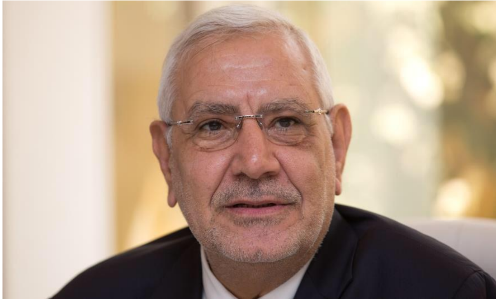
Abdelmoniem Aboufotouh

Former presidential candidate and founder of Misr Al-Qawia party, Abdelmoniem Aboufotouh, aged 69, has been detained since 14 February 2018 over unfounded charges in relation to media interviews. 228 According to credible sources, he has been detained in Mazraet Tora Prison in solitary confinement in a cell measuring 2m x 3m that is hot in summer and cold in winter, and does not have a bed. The prison administration has limited his access to exercise to an alley inside the ward for no more than one hour a day. Sometimes the prison administration allows no exercise time at all. 229