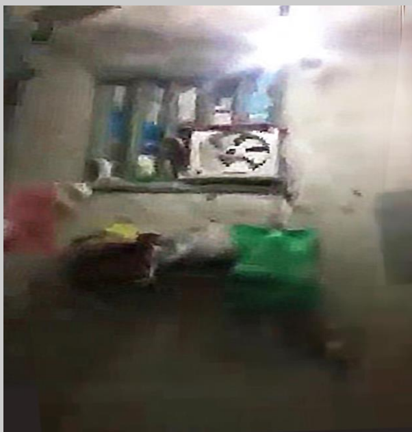
Still taken from video filmed in Al-Aqrab Prison in October 2020 and shared with Amnesty International