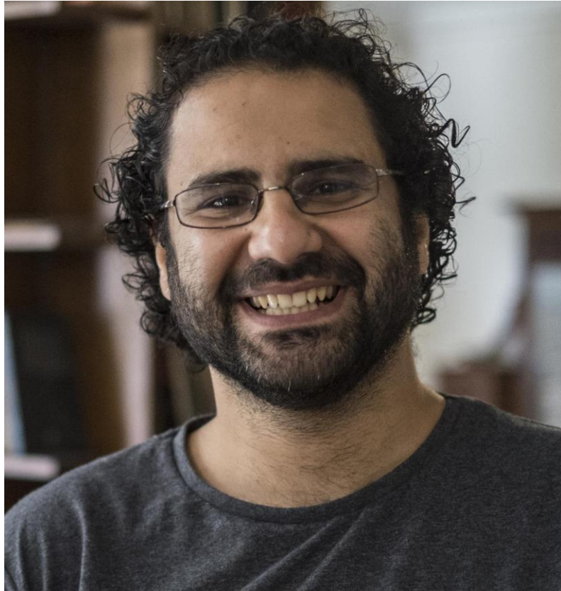
Alaa Abdelfattah